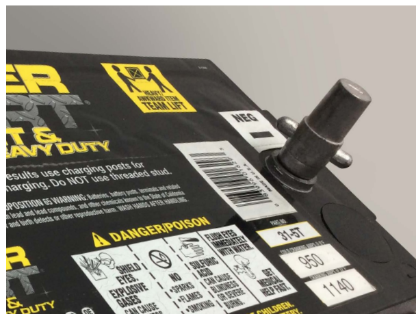
For Threaded Stud Terminals Use Part# SS 01477