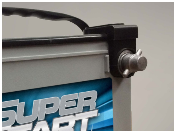
For Side Terminals Use Part# SS 01335